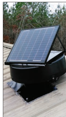
Solar Attic Fan